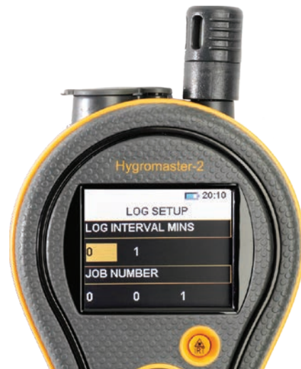
Set interval 1 minute to 24 hours