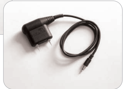
BLD5060 Heavy Duty 2-Pin Probe