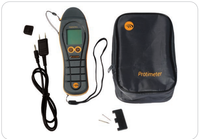
BLD5702 - Digital Mini Standard Kit