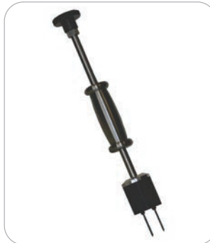
BLD5055 Heavy Duty Hammer Probe