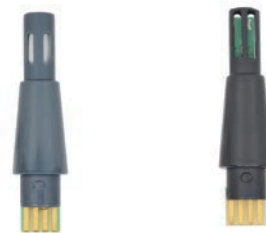
Hygrostick part number POL4750, for high moisture applications.