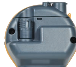
Quikstick ST POL8751, standard with all MMS3 kits and with the same performance as the standard Quikstick. A Quikstick ST can remain connected to the MMS3 while using the pins.

MMS3 may be used with three styles of interchangeable humidity probe, the Hygrostick, the Quikstick and the Quikstick ST. The Hygrostick (grey POL4750) can be used for high moisture applications such as concrete measurement. Quikstick (black POL8751) is a general purpose, fast-responding full range sensor.