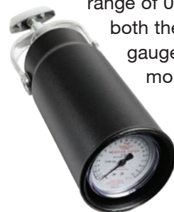
Standard Size Speedy

A pressure gauge with a moisture measurement range of 0 - 20% is fitted as standard to both the Large and Small vessels, but gauges with both wider and narrower moisture ranges are available.